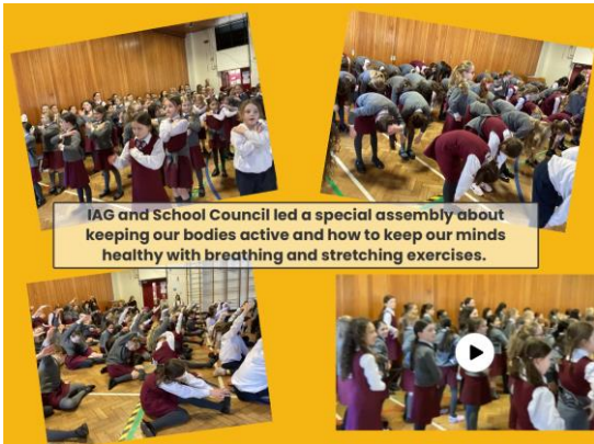
IAG and School Council led a special assembly about keeping our bodies active and how to keep our minds healthy with breathing and stretching exercises.

What do you do with an extra day in February? You maximise the fun that month!! Prep held a wellbeing week at the end of February with all action groups planning special events to help banish the winter blues and spring into the new season. With bun sales, fruit smoothies, yoga, mindfulness walks, positivity stones and the macarena, it lifted everyone's spirits.